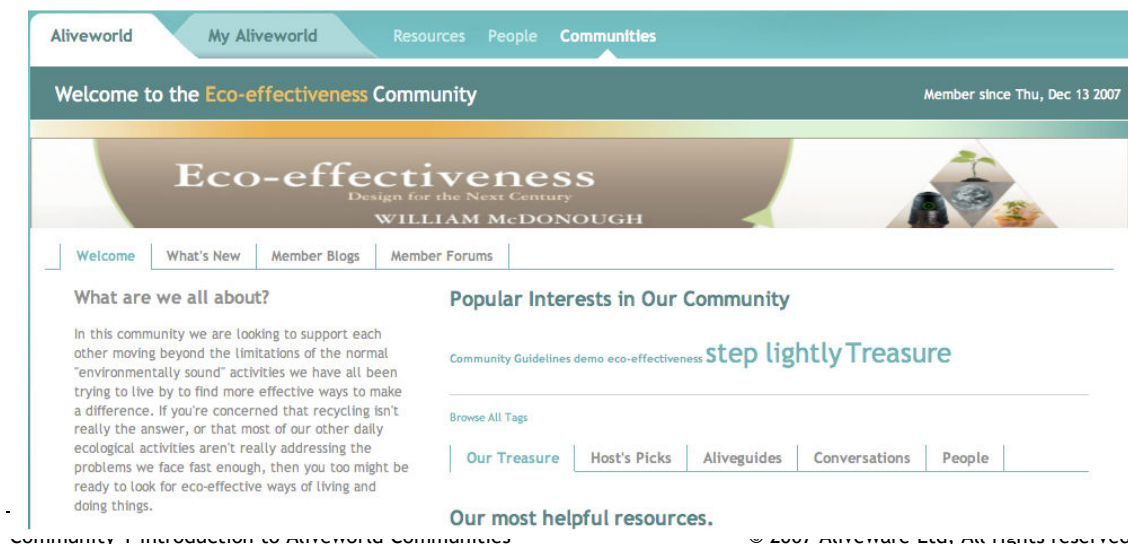
Figure 2: Aliveworld Community home page – members view

Communities have many features in them for Aliveworld users to take advantage of. These features are accessible from the Community home page. Note that some of the features are only accessible once you have joined the Community.